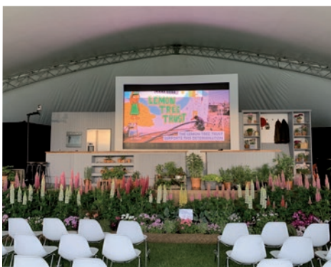
Pictured: RHS Chatsworth Flower Show 2019, where Lemon Tree Trust presented its work alongside Becky Crowley, Chatsworth's cut flower gardener.