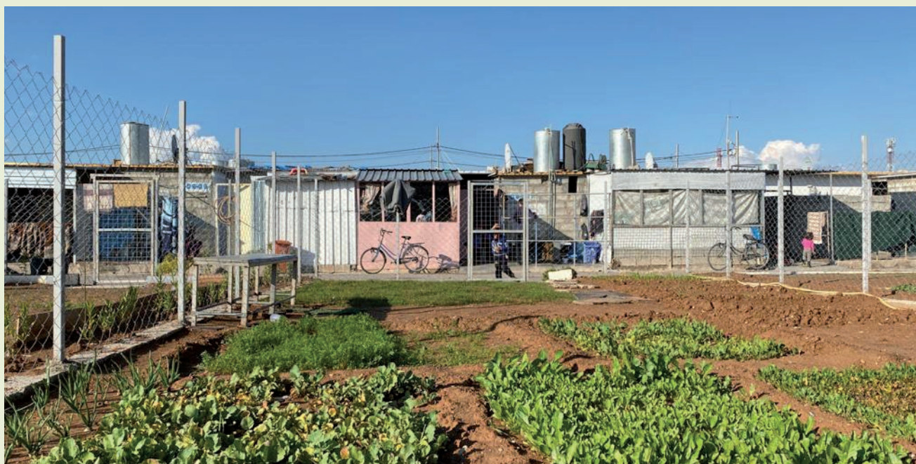
Pictured: Community gardens have been established by residents in unused space between shelters in Kawrgosk camp in the Kurdistan Region of Iraq. We visited this camp in November 2019 for an informal seed distribution.

they are built and maintained by the communities they will benefit. Our partnership with the Royal Horticultural Society continues to go from strength to strength and in 2020 we will create family-friendly gardening activity sheets for families and schools to enjoy. Furthermore, we will continue to partner with Mr Fothergill's for our seed distribution programme.