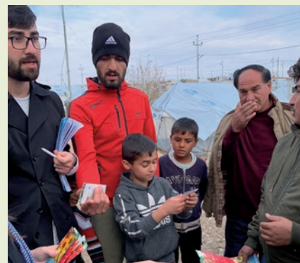
Pictured: Our first informal seed distribution in Bardarash camp in the Kurdistan Region of Iraq.

In December 2019, we visited Bardarash camp to distribute some of these donated seeds. Bardarash is a remote camp that was reopened in November 2019 to accommodate a new influx of people displaced by the Turkish invasion of Northern Syria in autumn 2019. We intend to do more in this camp, which lacks basic infrastructure and offers little in the way of opportunity for the families who are living there.