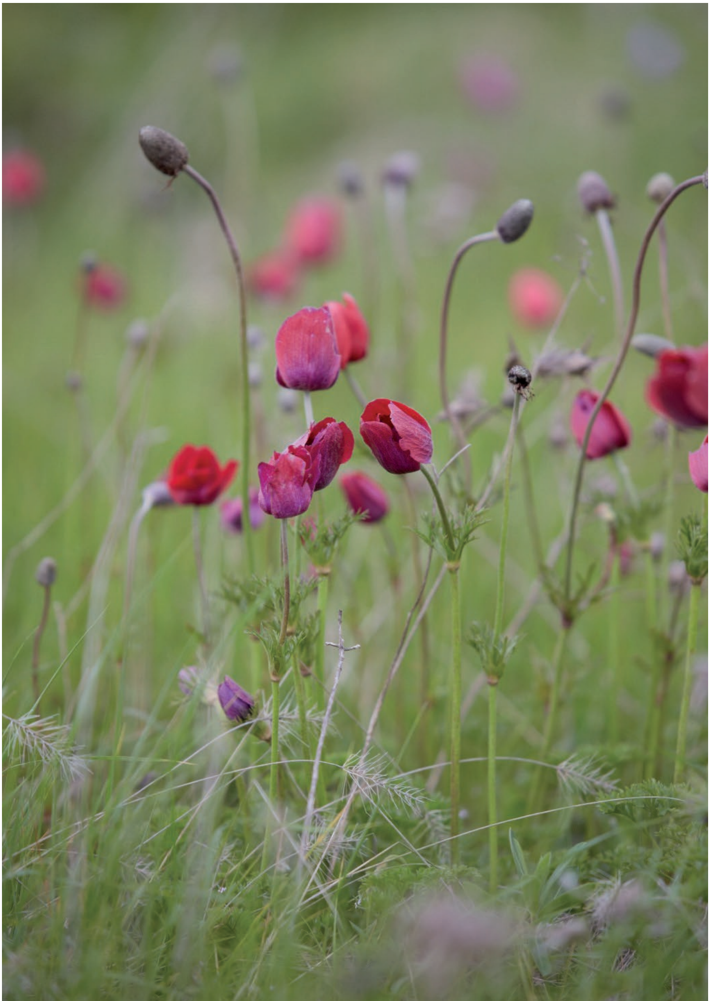
Pictured: Anemone coronaria growing wild on the Ninewa plains in the Kurdistan Region of Iraq.